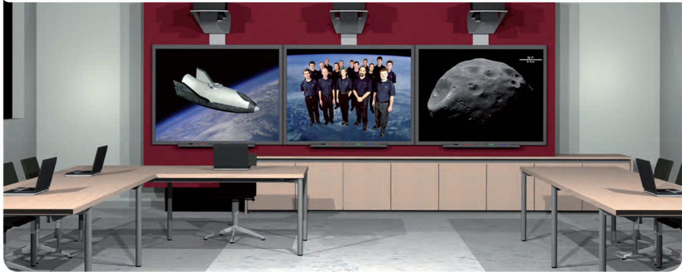
At Vanerum's Bochum location, 12 employees now benefit from the advantages of Canon's document management system.