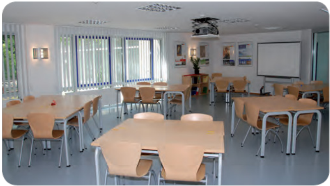
Thanks to electronic document management, Vanerum GmbH can now access project files instantly and provide faster responses to customers.